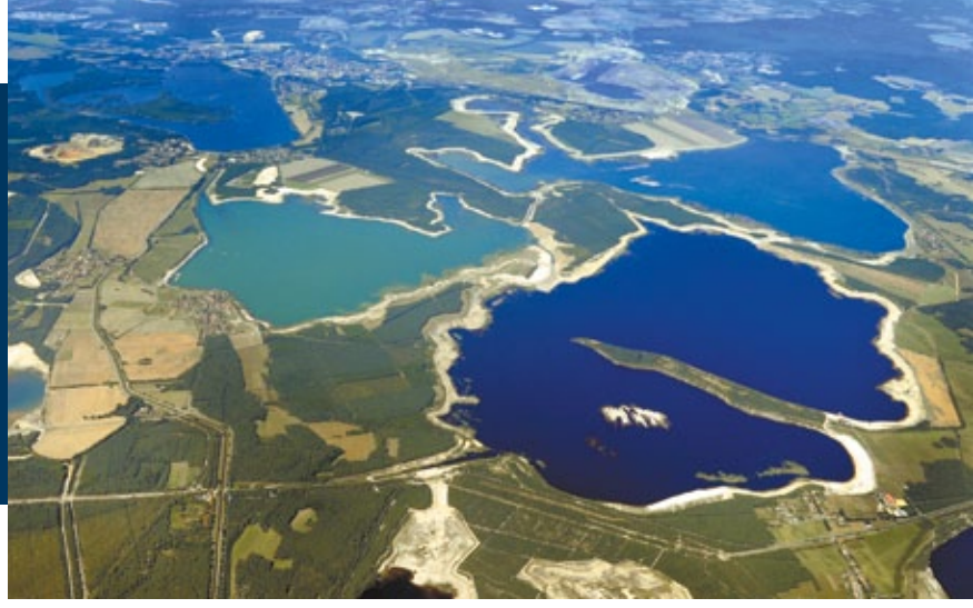
The emerging Lausitzer Seenland