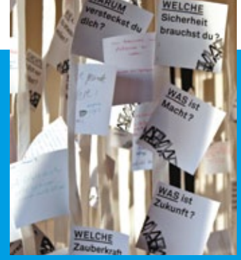
Questions and answers in the "Raum der Ideen" in the "Zeichen von Respekt" exhibition