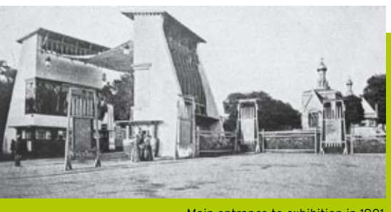
Main entrance to exhibition in 1901