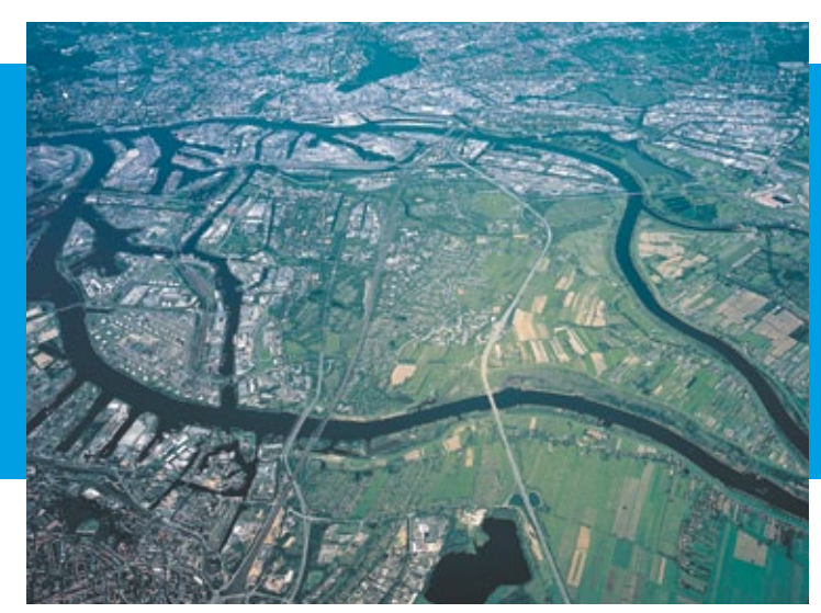
A bird's eye view of the IBA area