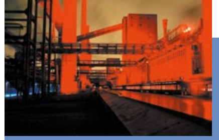
Kokerei (coking plant) Zollverein